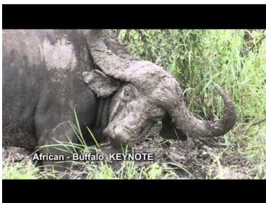
AFRICAN BUFFALO KEYNOTE