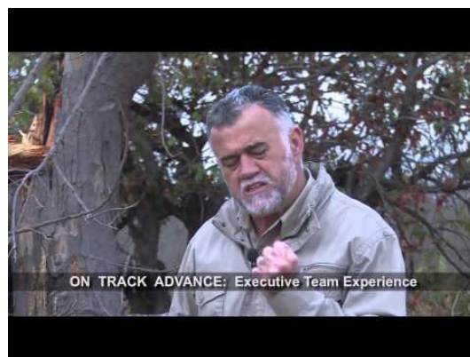
ON TRACK ADVANCE