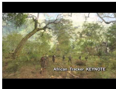
AFRICAN TRACKER KEYNOTE