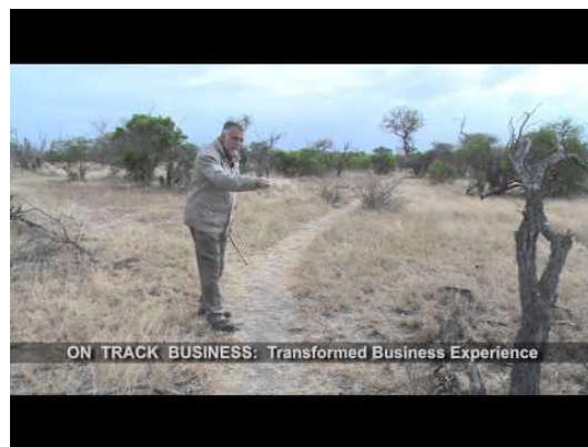
ON TRACK BUSINESS

Using Bateleur Safari Camp as a very comfortable base, each On Track Bateleur Experience takes place on 10.000 hectares of the world famous Timbavati Reserve. Sharing unfenced borders with the Kruger National Park itself, this is an exceptional Big 5 safari location and one of the last remaining truly untamed pieces of Africa.